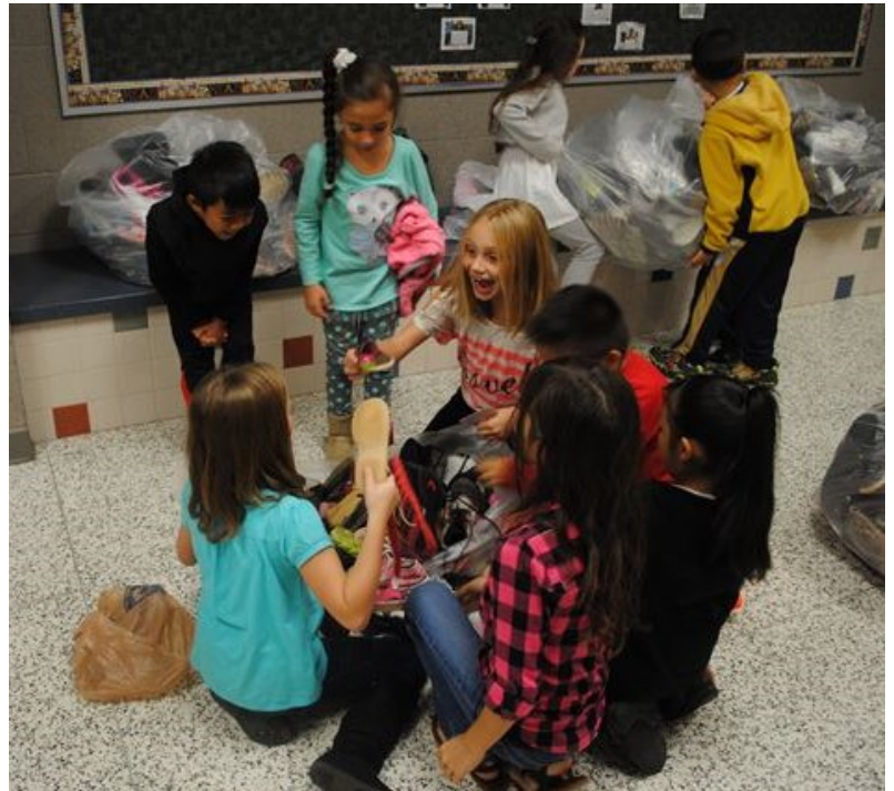
Students at Model Elementary sort through donated shoes.