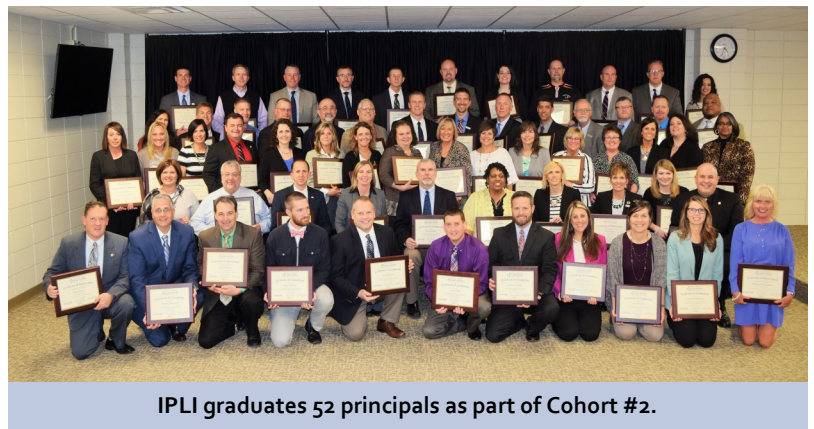
IPLI graduates 52 principals as part of Cohort #2.

On Monday, April 11, 52 principals graduated from the Indiana Principal Leadership Institute. Along with two teacher-leaders who have been attending IPLI Seminars with their principals this year, many of the principals' superintendents joined in the afternoon ceremony to celebrate the completion of the two-year program.