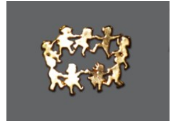
Circle of Children Pin