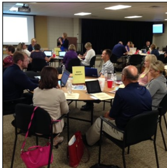
INALI Cohort #2 at the February seminar

INALI Cohort #3 will begin its two-year program on Sunday, July 17, 2016, starting with the New Administrator Workshop. INALI is designed to help beginning administrators become effective instructional leaders and to quickly