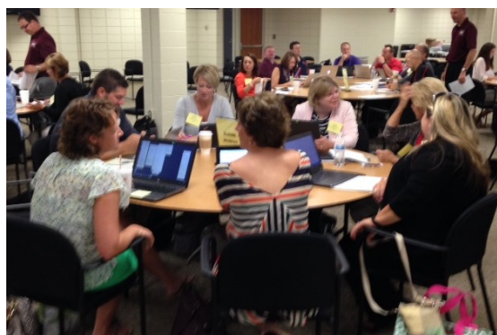
INALI participants at the Summer Seminar